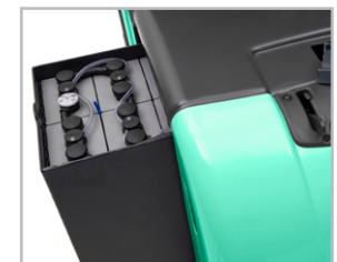
Robust battery rollers