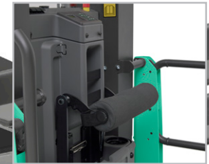
Optional driver's cushion