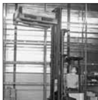
Clear-view mast and diagonal standing position improve visibility and comfort.