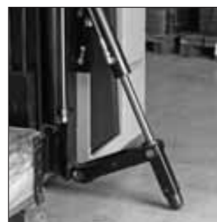
Residual capacity at higher lifts can be increased using side stabilisers (standard on triplex mast).